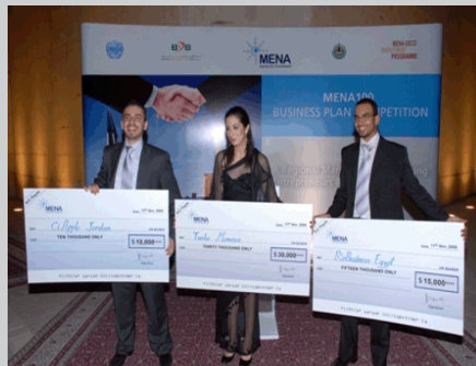
Winners of the MENA 100 business plan competition