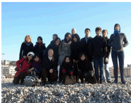
Students participating in intercampus exchange program

From Friday 11th of December to Sunday 13th, a group of 20 Sciences Po students from the Paris campus went to meet students based at the Le Havre regional campus. This intercultural and intercampus exchange was organised by «La sauce culturelle», a student association at Le Havre campus, and Asie Extrême, the Asian association of Sciences Po's Paris campus.