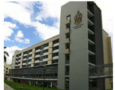
Raffels institution in Singapore